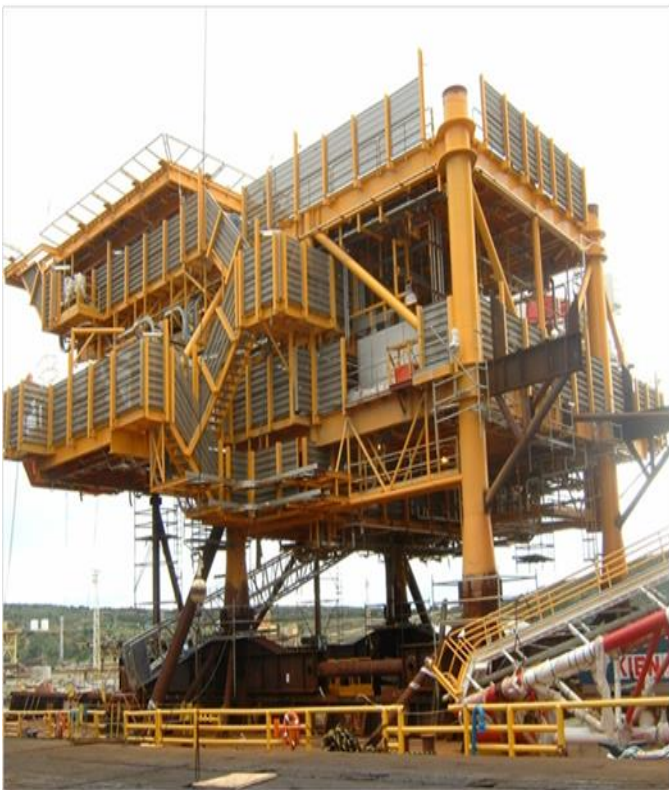
Total Carina Aries Project

Wind wall & wind shield panels are pressed into trapezoidal sections with longitudinal edge returns to provide strength. They are designed to run horizontally to a height of 3m between posts designed to cantilever up from the deck and these will be positioned at centres to suit clients requirements up to a maximum of 3m.