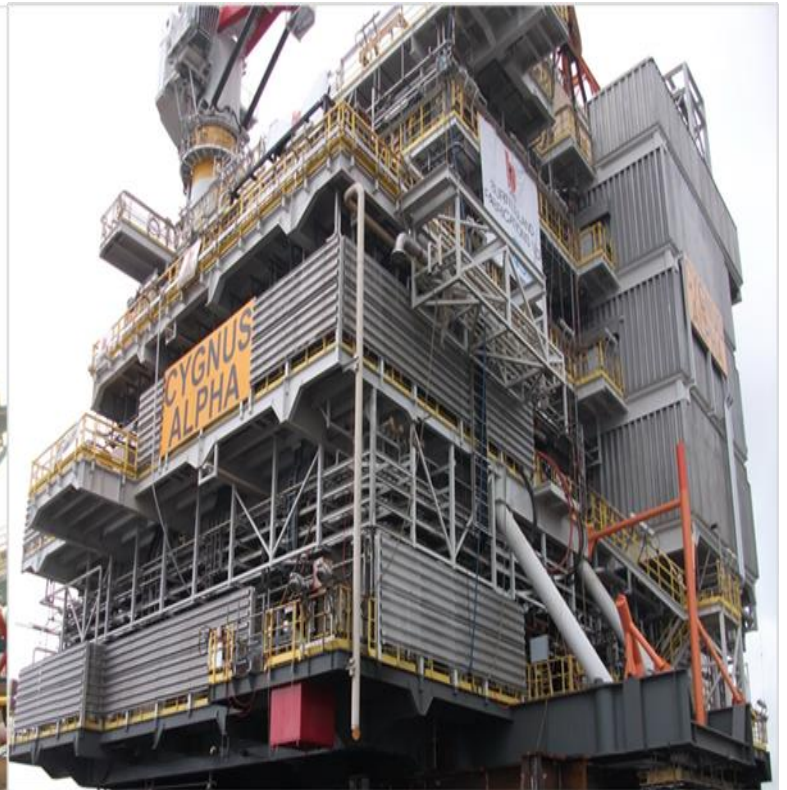
Gaz de France Cygnus Project