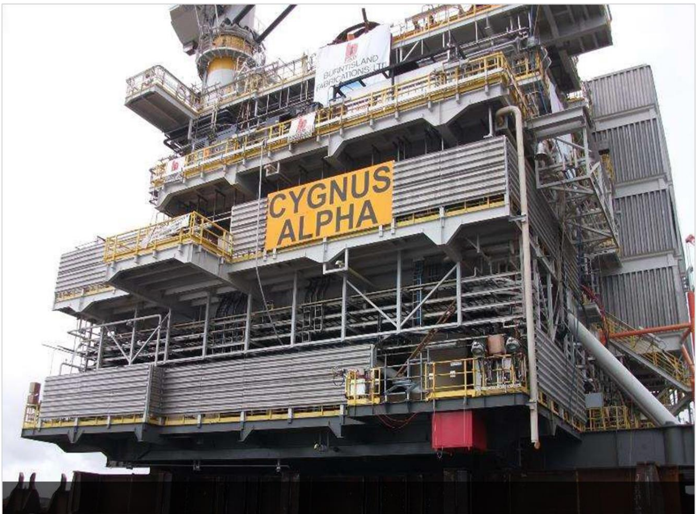
Gaz de France Cygnus Project

MTE wind walls – wind shields do not have any moving parts and are designed to work as efficiently as possible at providing protection from storm winds and driving rain. MTE wind walls achieve an immediate percentage reduction in incident wind velocity more than 75%. The energy dissipating design of the system means that half a metre behind the panel the percentage reduction in wind velocity increases to 86%. MTE wind walls have been fully tested to ensure no additional background wind noise is generated.